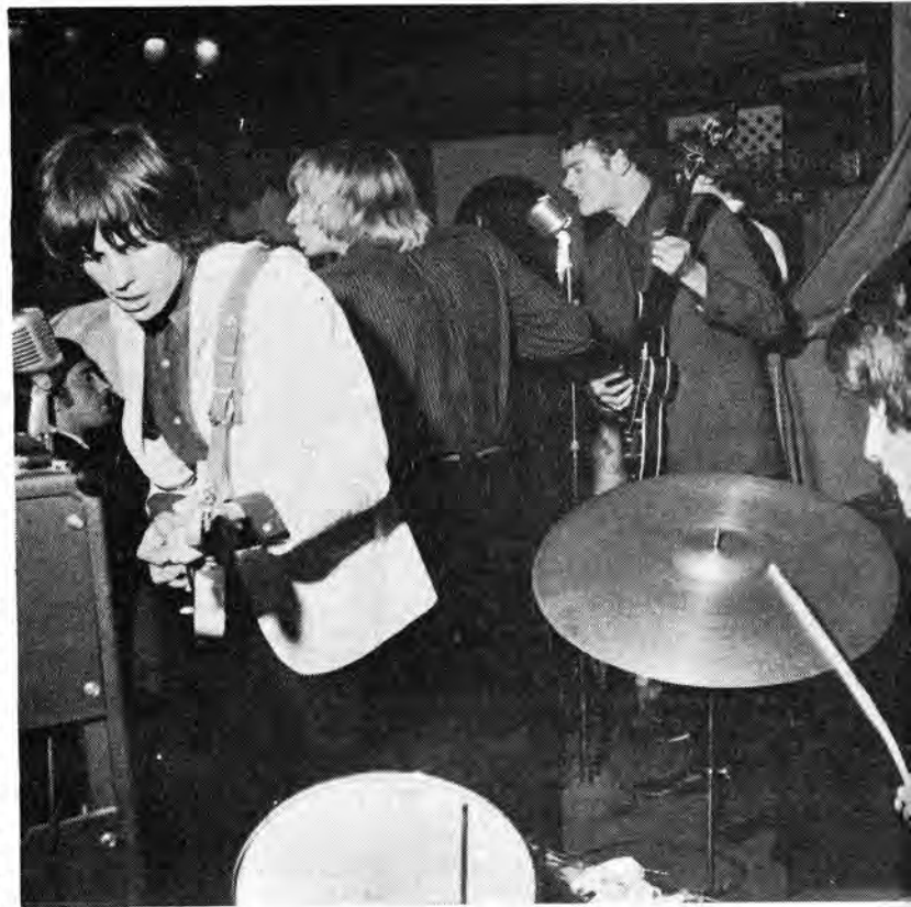
Shortly after this interview, Jeff quit the Yardbirds and signed a contract with record producer Mickie Most as a solo artist.

JEFF: (Embarrassed laugh) Apart from being a tramp, I was playing